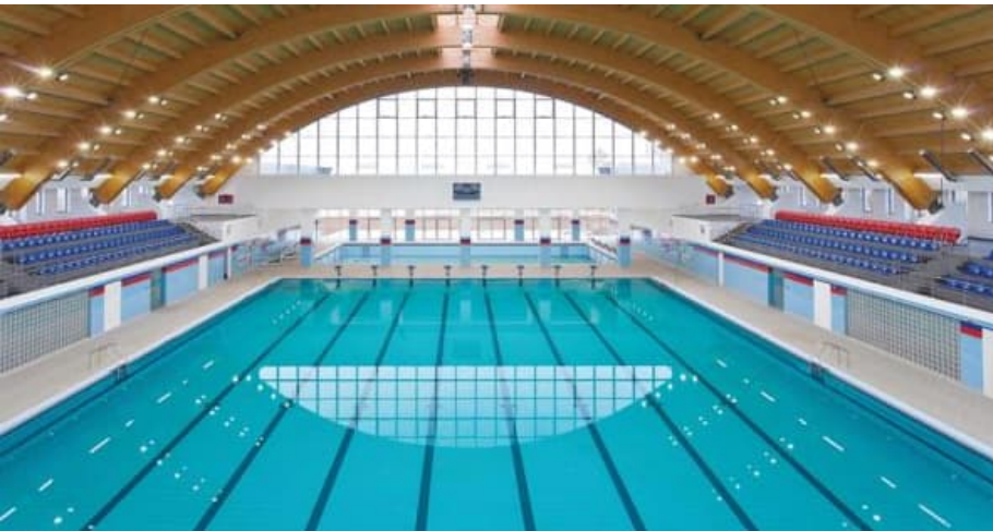
Swimming – CSA Steaua Bucharest Pool